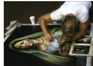
A Grade Open Projected Image