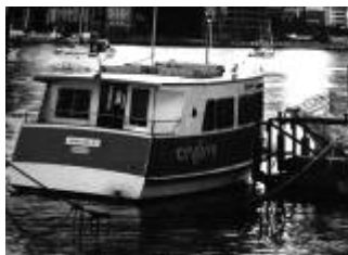
B Grade Monochrome Print