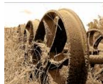
A Grade Monochrome Print