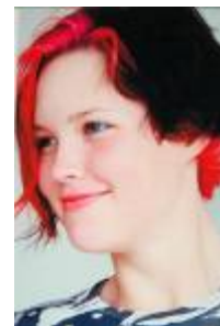
A Grade Open Print