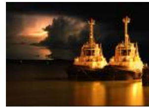
A Grade Set Subject Projected Image