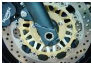
B Grade Open Print