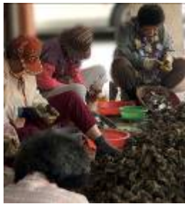
B Grade Set Subject Projected Image