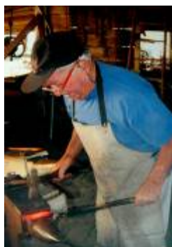
B Grade Set Subject Print