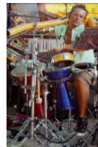
A Grade Set Subject Print