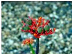
B Grade Open Projected Image