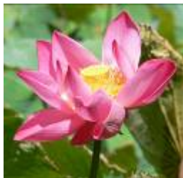
B Grade Open Projected Image