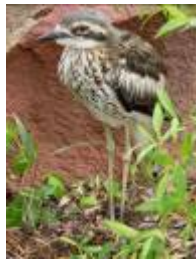
B Grade Set Subject Projected Image