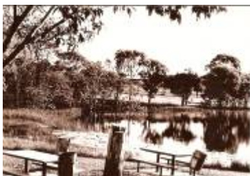
B Grade Monochrome Print