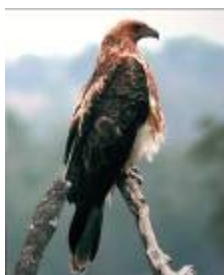
B Grade Set Subject Print