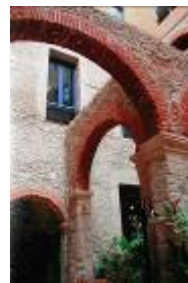
A Grade Open Print