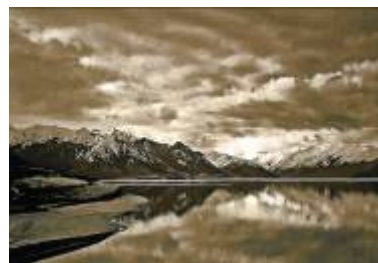
A Grade Monochrome Print