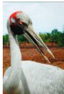
A Grade Set Subject Print