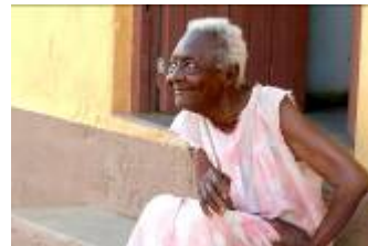
A Grade Open Projected Image