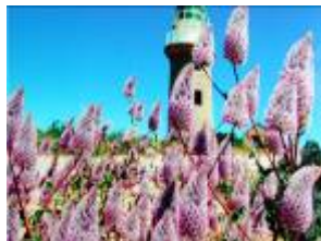
B Grade Open Print