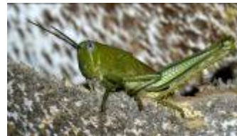
A Grade Set Subject Projected Image