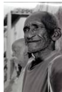
A Grade Monochrome Print