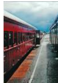
A Grade Set Subject Print