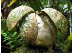
B Grade Set Subject Projected Image