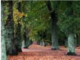
B Grade Open Projected Image