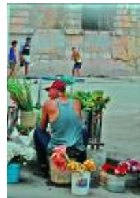
A Grade Open Print