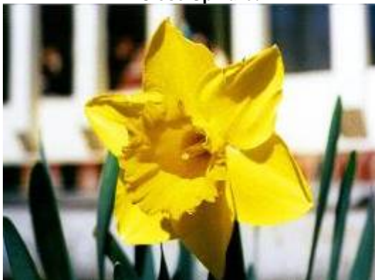
Close Up Daffodil