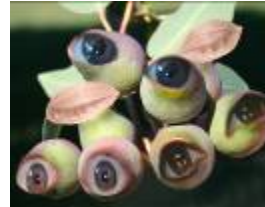
A Grade Set Subject Projected Image