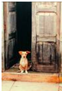
B Grade Set Subject Print