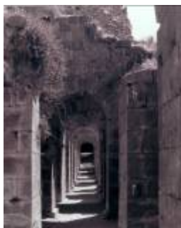
B Grade Monochrome Print