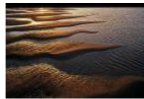
A Grade Open Projected Image