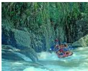
B Grade Open Print