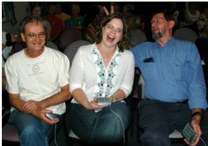
Our Judges relaxing

Another Great Night! Thirty seven members including six visitors made up the "Madding Crowd" at our Premier Comp of the year . This is the competition where our guest judges had to pick the 'best of the best' out of our place-getting images, both prints and projected, throughout 2007. Well we had our projector set up and our 'you beaut' computerized judging equipment and our judges performed a sterling service. At one stage your editor thought that he'd better take his 'rubbish' and go home, however he stopped sulking and thoroughly enjoyed the judges choices. The results below show how accurate their choices were. Editor's Congratulations to all the placegetters!