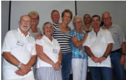
The 2008 Committee