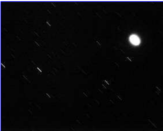
Star trails, 5 minutes, f2.8, 20 mm lens at 100 ISO The large white "blob" is the planet MARS when it was close to Earth in 2002