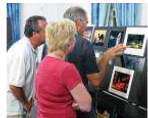
"Looking at the Decisions"