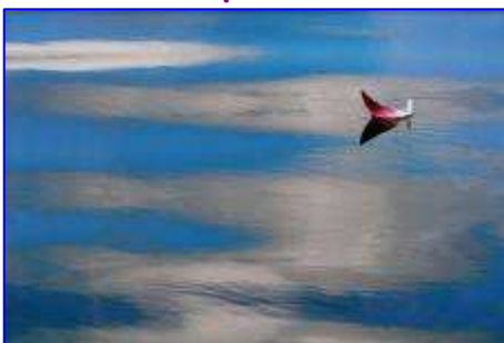
Rob Cross 'Billabong Peace'