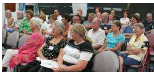
Waiting for the Decision"