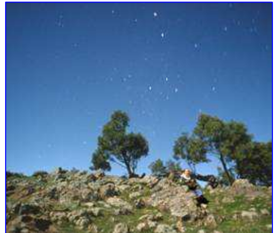
Full moonlight, with star trails 3min 20 sec, f2.8, 20mm lens at 100 ISO