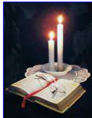
Hazel Morrow 'Candle Lights'