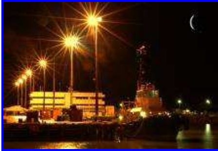
Fran Cross "Darwin Harbour"