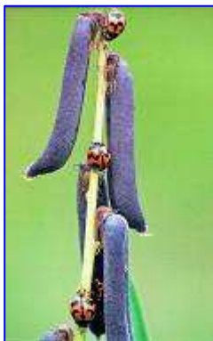
Paul Kelly 'Four Ladies'