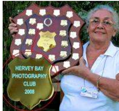
The Mamiya Shield for highest aggregate points in the 2008 PSQ Colour Print Competition.