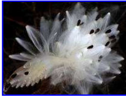
Trish Taylor "Seed Pod"