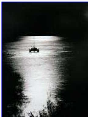
Trevor Sontter 'Cat in the Moonlight'