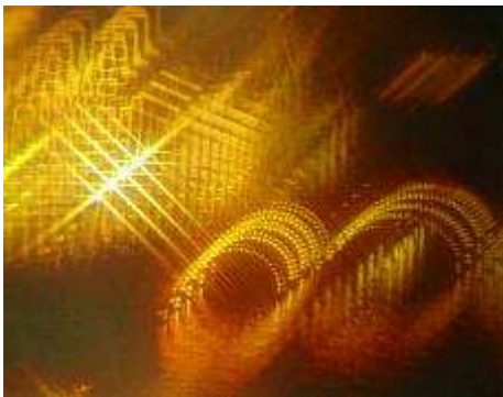
Multi Parallel and Star