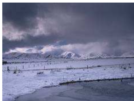
Graduated Grey Filter