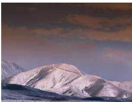
Graduated Tobacco Filter