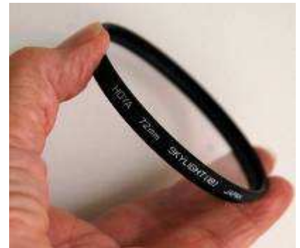
Screw on Filter